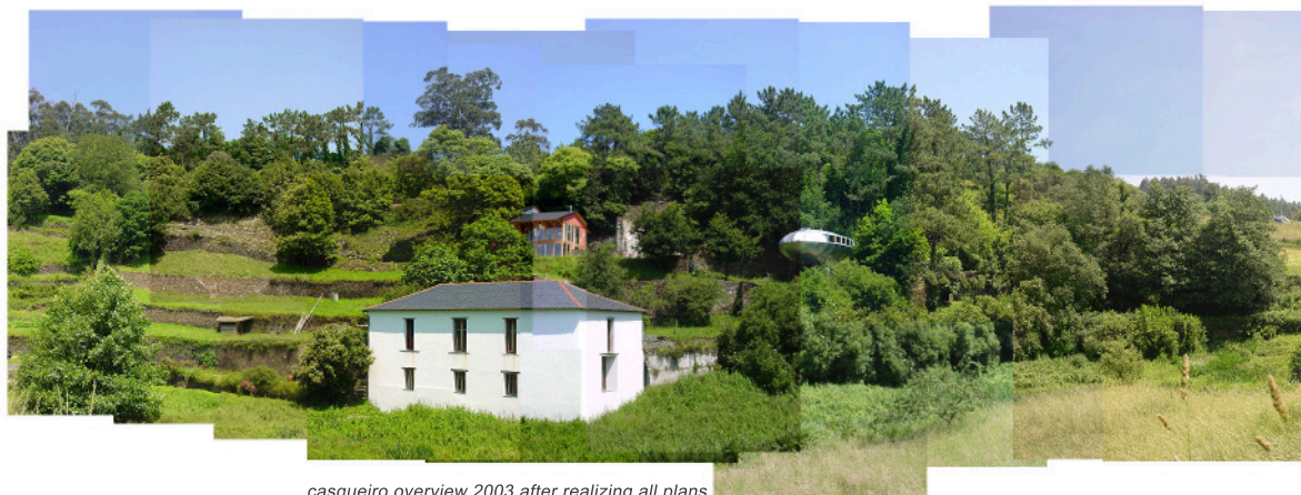
casqueiro overview 2003 after realizing all plans