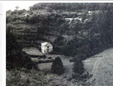
first foto taken in 1990