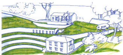
casqueiro overview in 1992, starting the renovation of the mothership