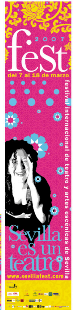
city entrance posters 1,5 x 7 m