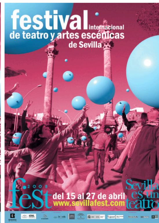
street poster 02