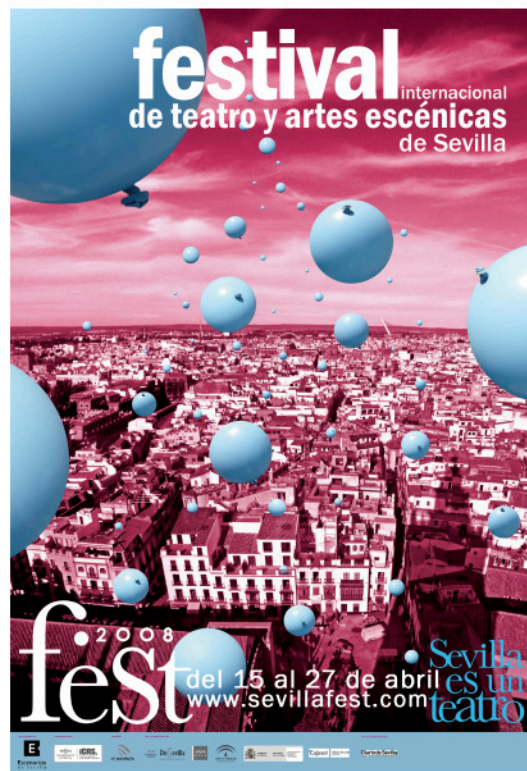
street poster 01