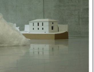
three images from the exhibition