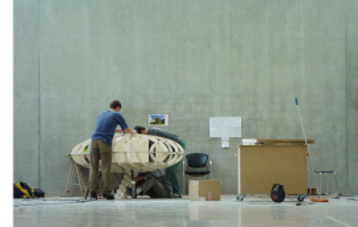
installing the models