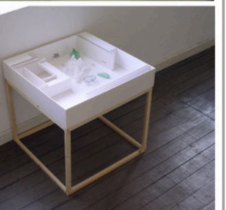
model of the models