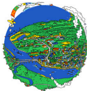
illustration for the t-shirt for "las fiestas de Navia"