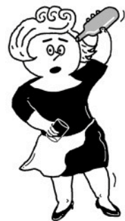
logo for a womens sidreria in Castropol, Asturias