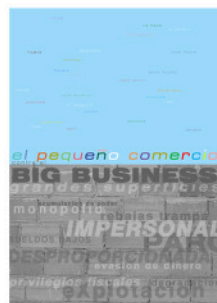
poster for the small (and against the big) commerce in Navia