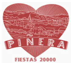
logo for las fiestas de Piñera, Asturias