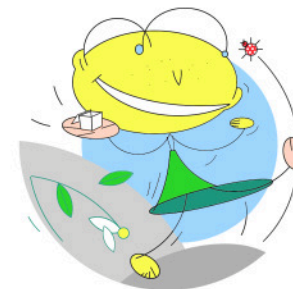
loveletterlogo for pupup-pam, Bari, Italy