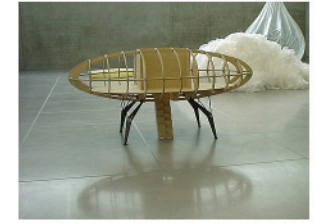
NAVEs model during spacePLACE