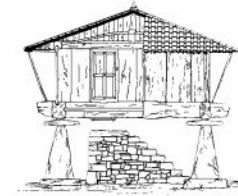
the asturian horreo