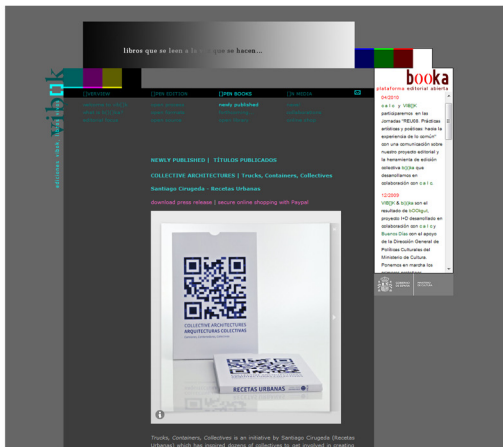
screenshot from viboks actual site