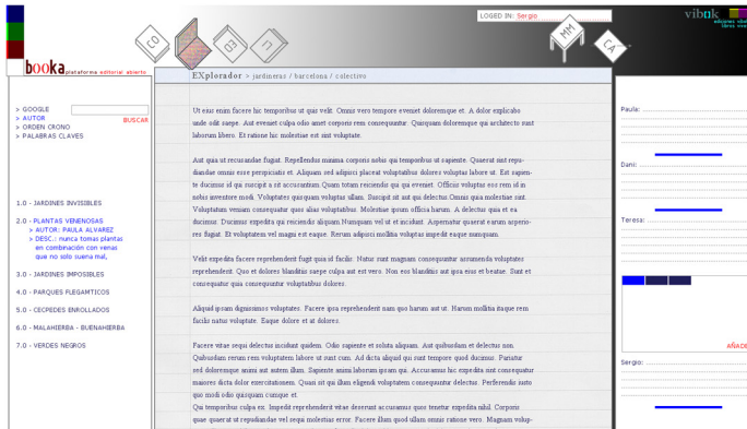
last proposal made for bookas "complementary interface design"