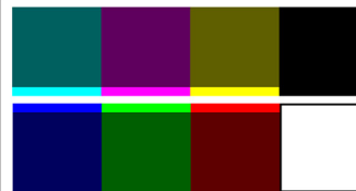
viboks (>print) and bookas (>screen) concept-design-basis: CMYK and RGBW